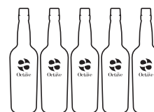
Around 88 bottles of exclusive Scotch Whisky