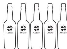
Around 88 bottles of exclusive Scotch Whisky