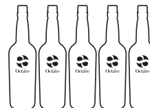
Around 88 bottles of exclusive Scotch Whisky