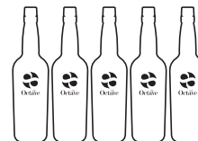
Around 88 bottles of exclusive Scotch Whisky