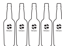
Around 88 bottles of exclusive Scotch Whisky