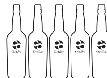
Around 88 bottles of exclusive Scotch Whisky