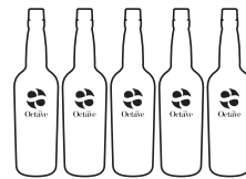
Around 88 bottles of exclusive Scotch Whisky