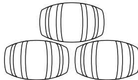
Shorter maturation in sherry octave casks