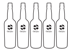
Around 88 bottles of exclusive Scotch Whisky