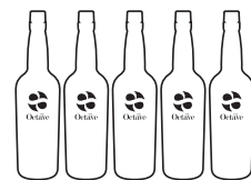
Around 88 bottles of exclusive Scotch Whisky