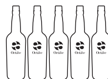
Around 88 bottles of exclusive Scotch Whisky