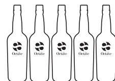
Around 88 bottles of exclusive Scotch Whisky