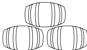
Shorter maturation in sherry octave casks