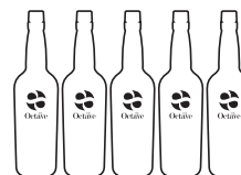
Around 88 bottles of exclusive Scotch Whisky