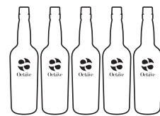
Around 88 bottles of exclusive Scotch Whisky